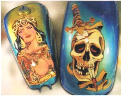
Fortune Favours The Bold on "Fortune Teller."