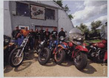
Our crew getting ready to leave Carl's Cycle Supply.