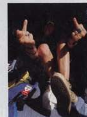
Not ready for her close-up!