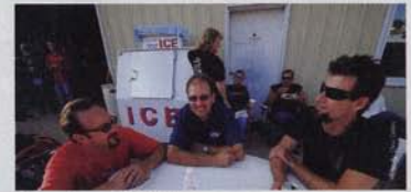
Meeting of the minds at Klocks pre Sturgis party.