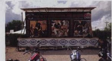
The Next Generation Exhibit at the Broken Spoke Saloon!