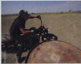
Scout goes tight to the barrel, notice the form!