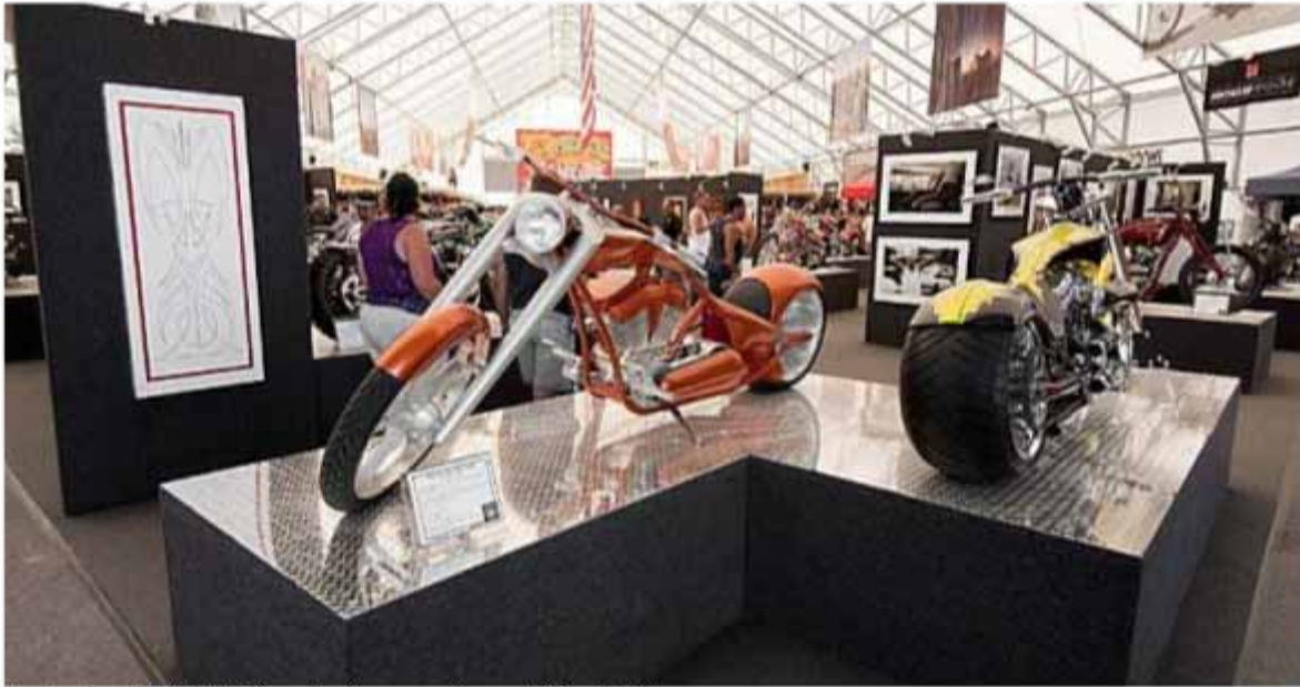
Last year's exhibit at the Thunder Dome was themed "Stay Gold"